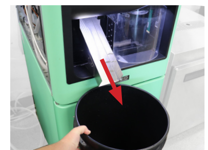
FIGURE 4 - Place Bucket