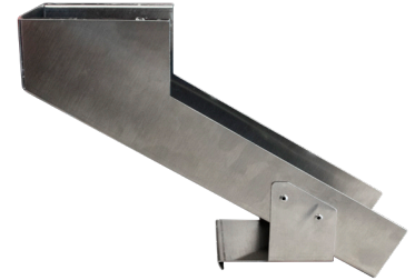
FIGURE 1 - Ice Removal Chute

Ice Removal Chute is used to safely move ice from the machine to a clean bucket for Ice Maker Sanitation, Ice Maker Descale and to test Ice Maker Motor in Service Outputs.