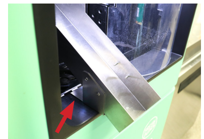
FIGURE 2 - Position Chute

NOTE: Position bucket close to end of chute to prevent spills.