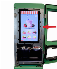
FIGURE 3 - Locate USB Port