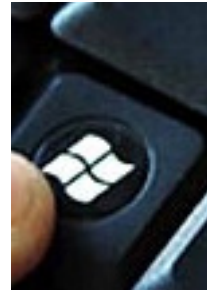
FIGURE 1 - Keyboard with Mouse Pad and Windows Key