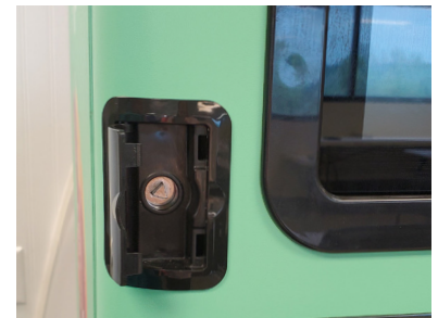
FIGURE 2 - Unlock and Open